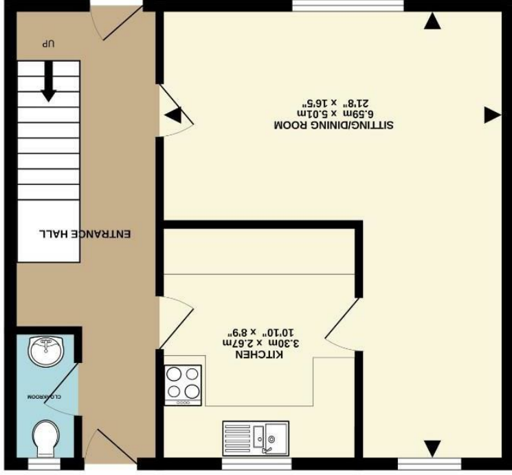
GROUND FLOOR 47.2 sq.m. (508 sq.ft.) approx.

TOTAL FLOOR AREA : 93.8 sq.m. (1010 sq.ft.) approx. Whilst every attempt has been made to ensure the accuracy of the floorplan contained here, measurements of doors, windows, rooms and other items are approximate and no responsibility is taken for any error, omission or mis-statement. This plan is for illustrative purposes only and should be used as such by any prospective purchaser. The services, systems and appliances shown have not been tested and no guarantee as to their operability or efficiency can be given. Made with Metropix ©2026